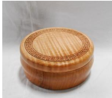
Two turned boxes with CNC decorated lids, boxes buffed with Biehl system