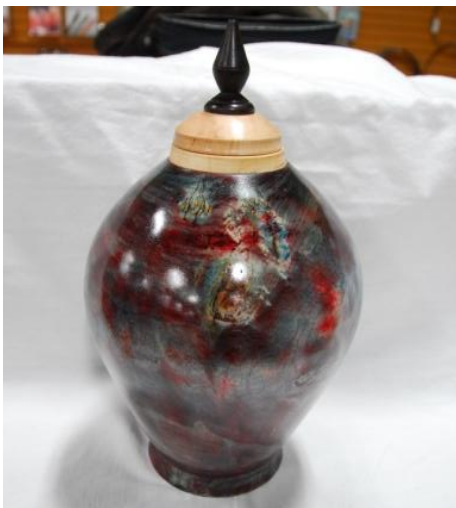
Box elder burl urn and lid, finished with same blue and red mohawk stains but gave different colors