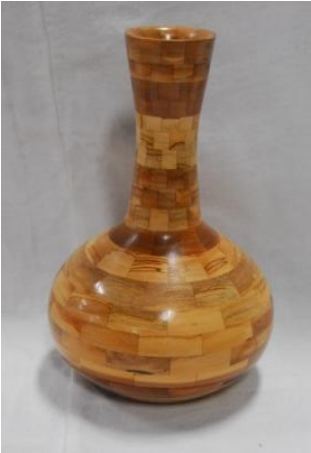
Spalted sweetgum wood segmented vessels