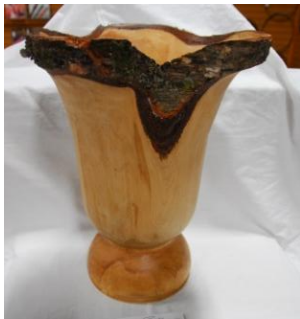
Large birch bowl