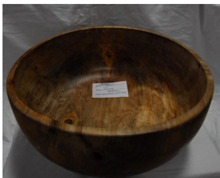
Large poplar wood salad bowl