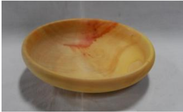
Manitoba maple bowl