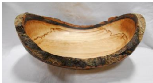
Spalted poplar live edge bowl