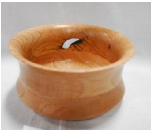
Oak bowl finished with Yorkshire grit