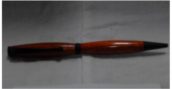
Blood wood pen dipped in polyurethane for finish