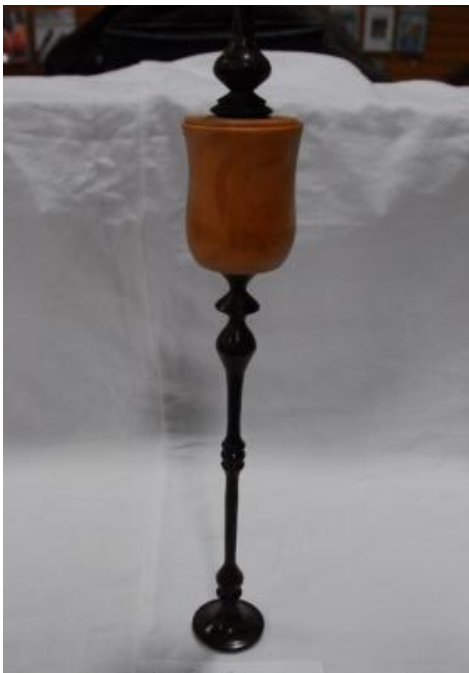
Wenge and cherry lidded box with long finial