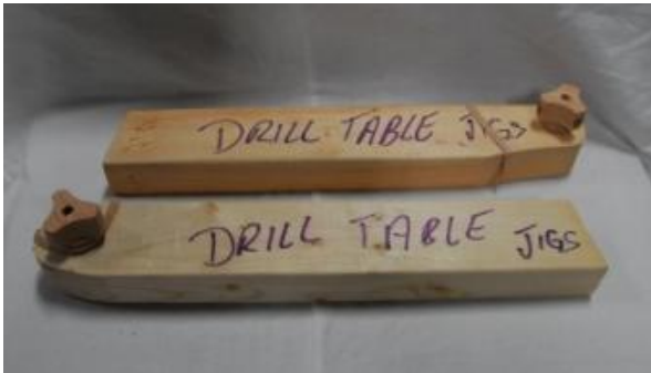
Hold down jig for drill table