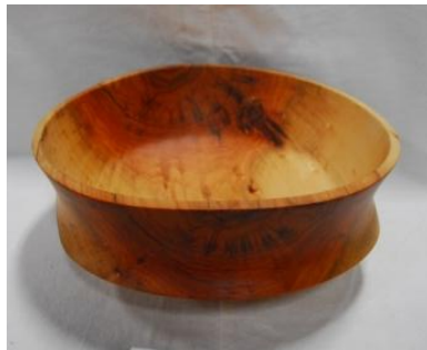
Small mystery wood bowl