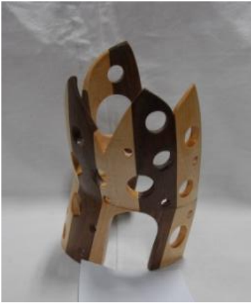
Wrecked Castle from game of thrones