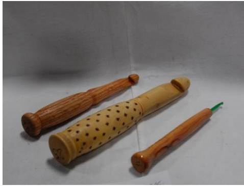
Crochet hooks made from lilac, red oak and an unknown wood