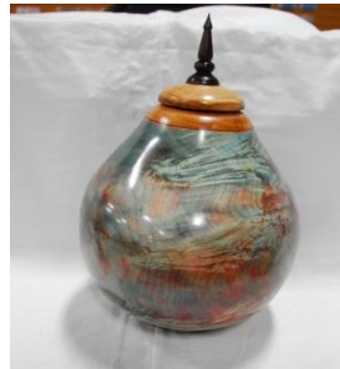
Figured maple bowl finished with wipe-on-poly Box elder burl urn and lid, blue and red mohawk stains