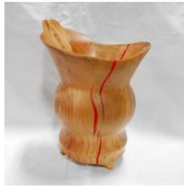
Manitoba maple bowl finished with Osmo oil and buffed on the lathe Apple wood vase with feet