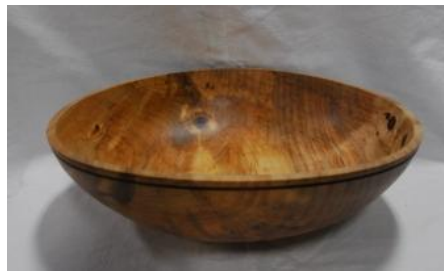
Poplar bowl cored from wood used for bowl below